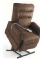
Pride & Theorem Lift Chairs