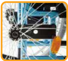
Centre of gravity adjustable