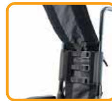
Adjustable velcro straps