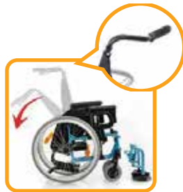
Foldable push handles with ergonomic design