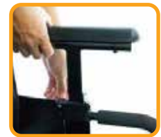
Detachable & height adjustable armrest

Choose Zippie EasyGo for unmatched flexibility and comfort!