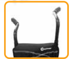
Height adjustable push handles

Parents will appreciate the thoughtful design of easy folding, height adjustable push handles, adjustable armrests and padded adjustable back upholstery