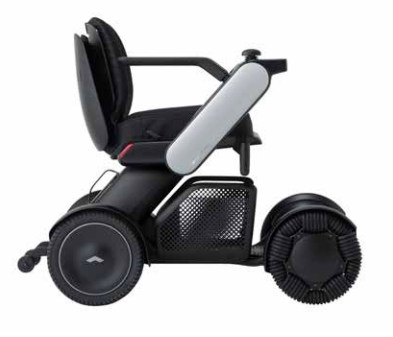
Grey LEFT / WCA870500 | RIGHT / WCA870510