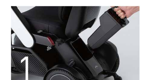
Remove the battery.

The Model C2 can be disassembled for easy transportation in the boot of any car. Whether you're shopping on the weekend or traveling with your family, the Model C2 allows you to live life to the fullest.