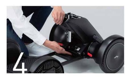
Pull the lever on the side of the battery towards you to separate the parts.