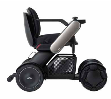
Gold LEFT / WCA870480 | RIGHT / WCA870490