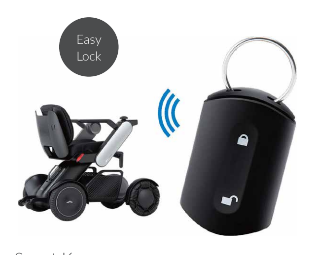
Smart Key Remotely lock the device.