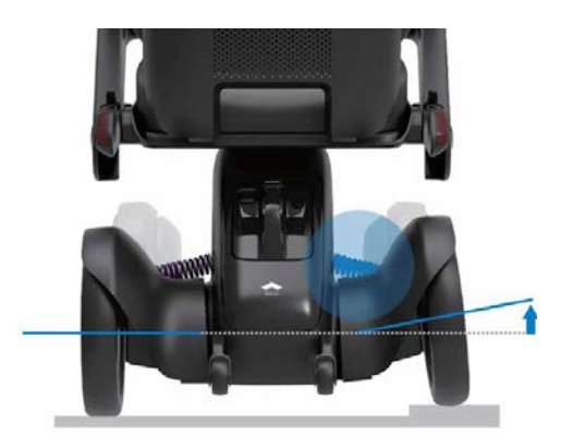
Rear wheel suspension absorbs the impact when driving over bumpy roads or obstacles.