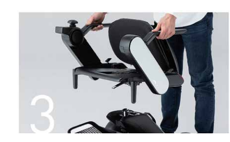
Pull the seat upwards.