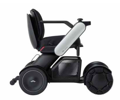
White LEFT / WCA870580 | RIGHT / WCA870590