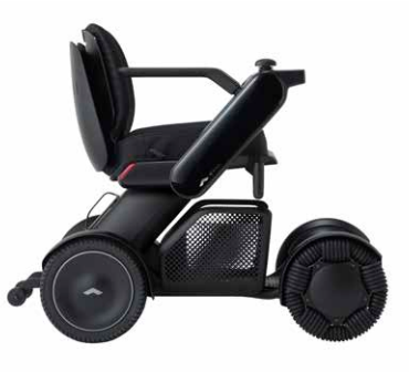
Black (supplied standard) LEFT / WCA870460 | RIGHT / WCA870470