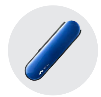
Arm Covers SEE PAGE 10-11 FOR CODES

Purchase accessories for even more convenience and personalisation.