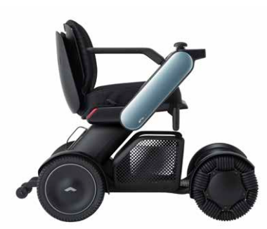
Light Blue LEFT / WCA870520 | RIGHT / WCA870530