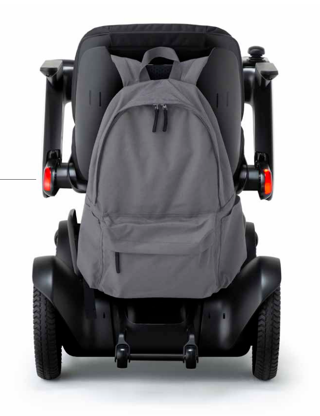
The tail light is clearly visible even with a bag hung over the back support, keeping you safe on the road at night.