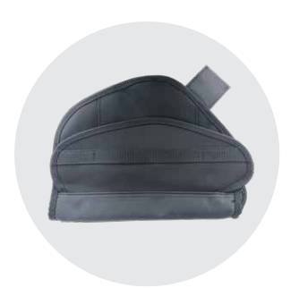
Side Storage Bag wca870430