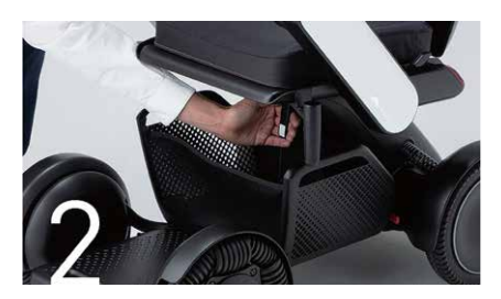
Raise the lever under the seat.