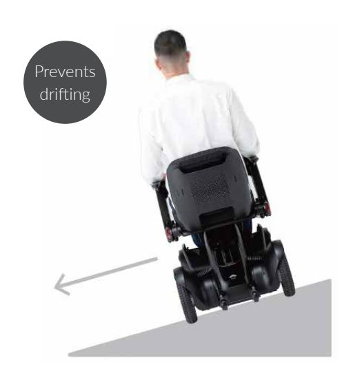
Drive straight on a tilted path.