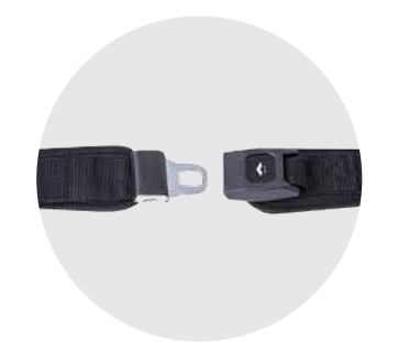
Lap Belt wca870420

Firmly stabilises the sitting position even on slopes. Note: Standard inclusion