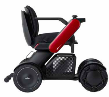
Red LEFT / WCA870600 | RIGHT / WCA870610