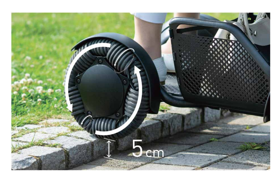
Effortlessly climb over obstacles up to 5cm in height with two powerful motors and large front omni-wheels.