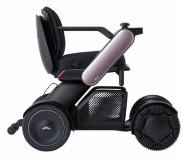
Pink LEFT / WCA870560 | RIGHT / WCA870570