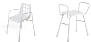
SHOWER STOOLS & CHAIRS