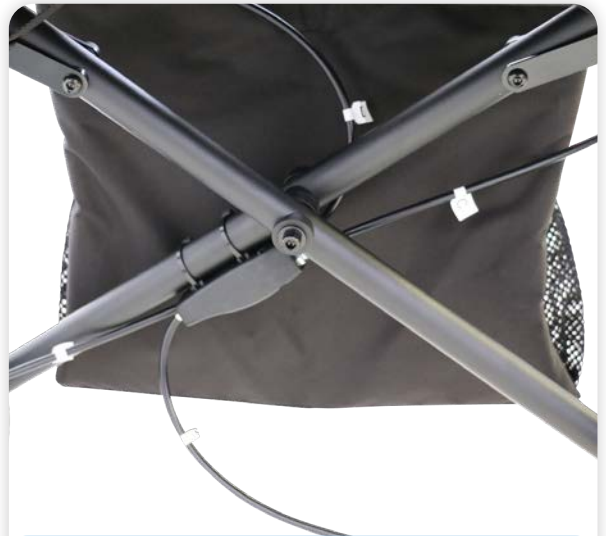
Single Hand Brake System* - Compatible with Aspire Vogue Carbon Walkers WAA695640

*Single Hand Brake System are not compatible with the Vogue Indoor Walker