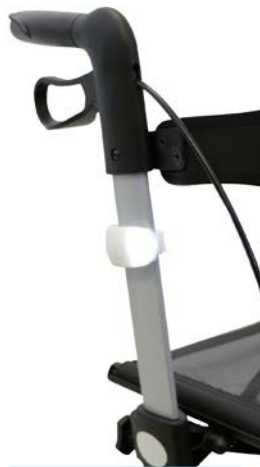
Night Light - LED Lamp WAA695630