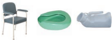
COMMODOES, URINALS & BED PANS