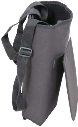
Oxygen Bottle Holder Bag WAA695600