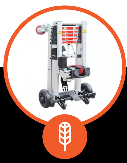
LIGHTWEIGHT COMPACT DESIGN