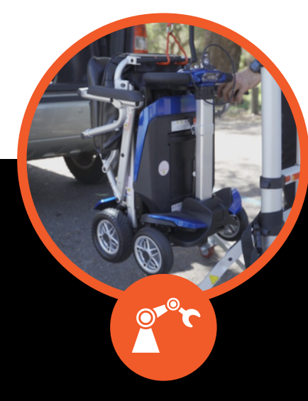
LIFTS UP TO 30KG