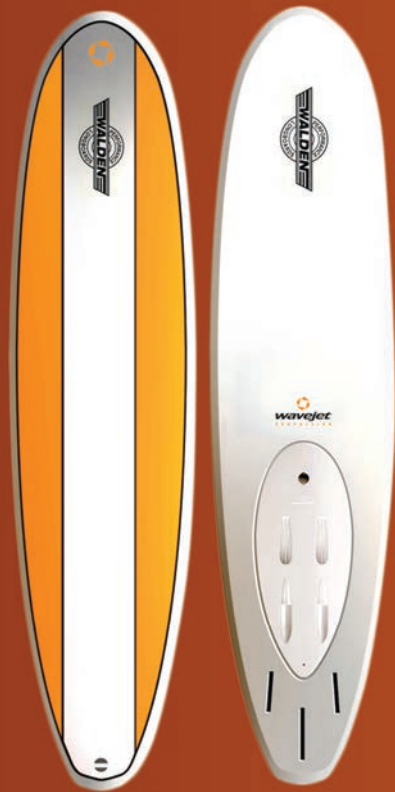
10' 0" WALDEN SUP