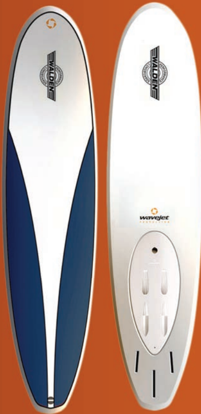
10' 6" WALDEN SUP