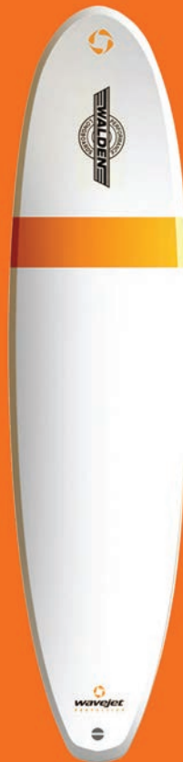
10' 0" LONGBOARD