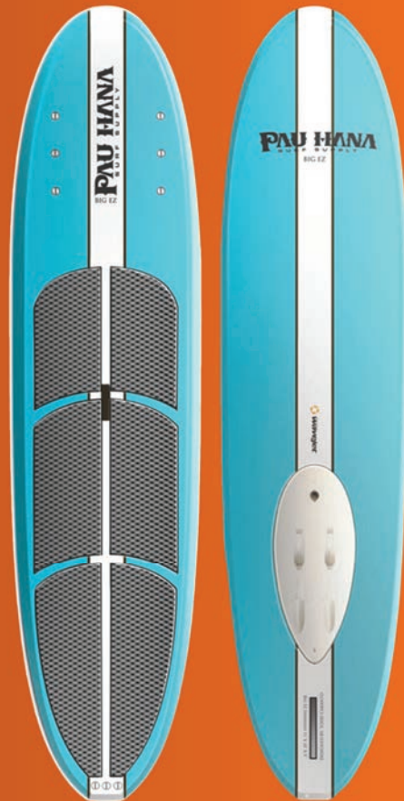
11' 0" PAU HANA BIG EZ