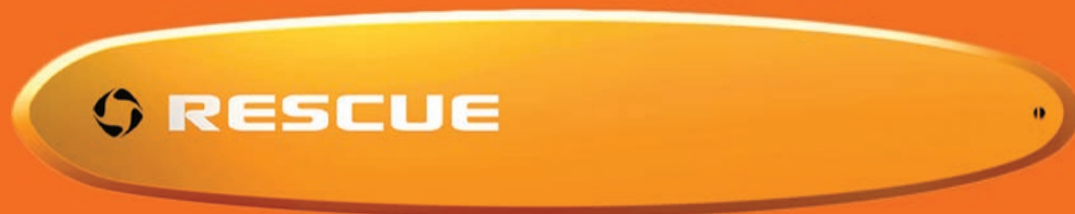
11' 0" RESCUE BOARD