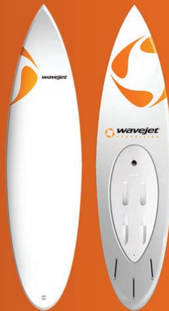
7'1" BIG GUY TRI SHORTBOARD