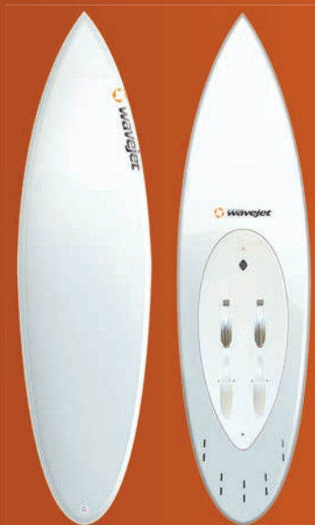
6' 6" PERFORMANCE SHORTBOARD