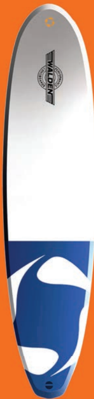
9' 6" LONGBOARD