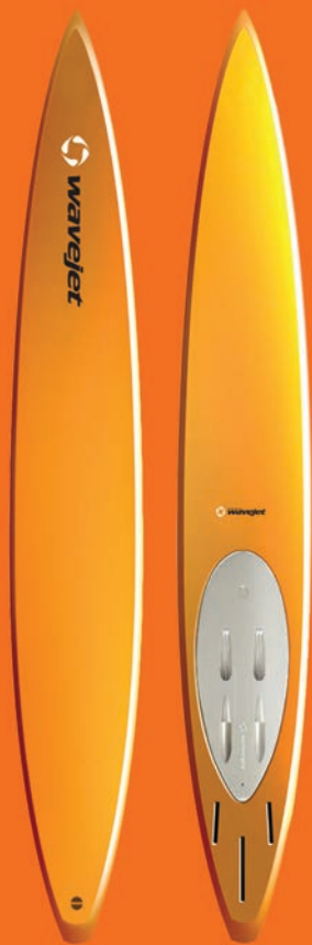
10' 4" GUN