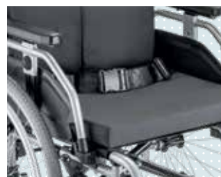
Lap belt with closure