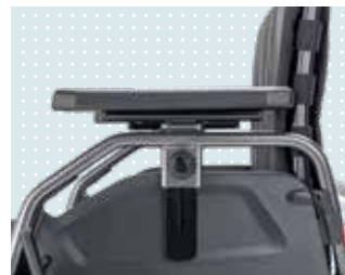
Height-adjustable forearm support