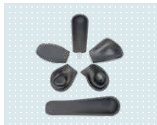
Arm and hand support