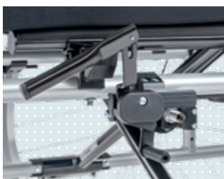
Wheel lock lever extension