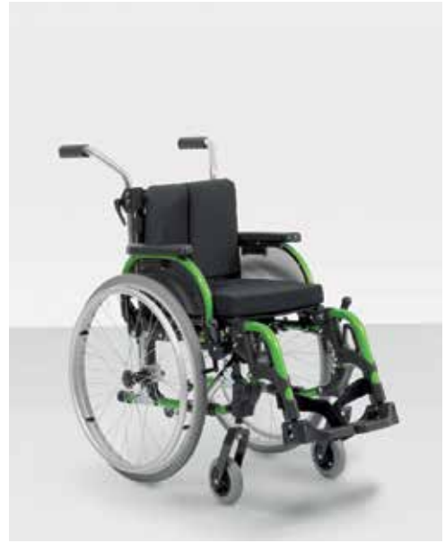
• Start M6 Junior – The model for kids Lightweight segment