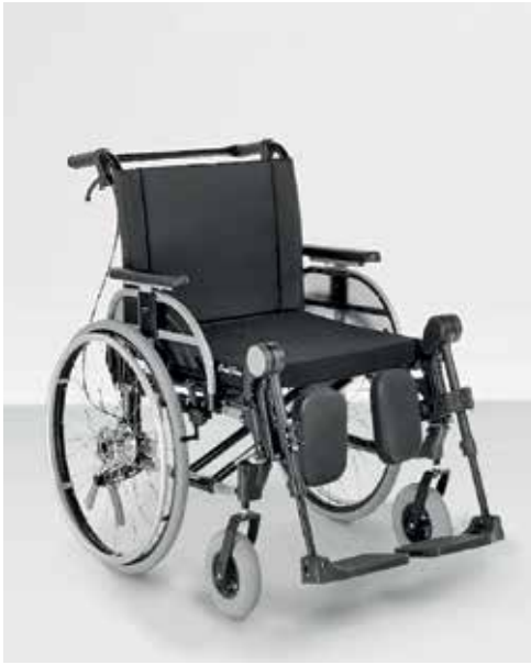
• Start M4 XXL – The model for special sizes Lightweight segment