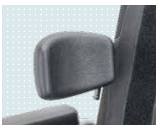
Lateral thoracic support