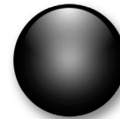
BACK IN BLACK