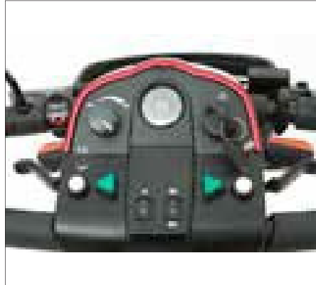
Easy Drive Tiller