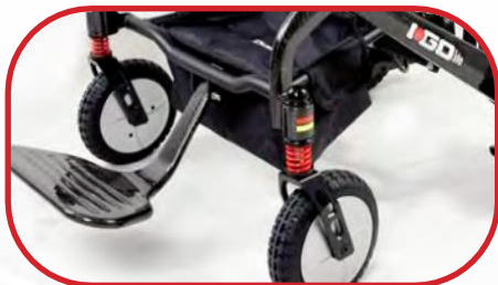
Comfortable front suspension