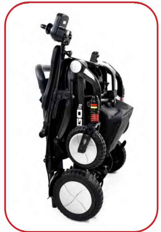
iGO Carbon Fibre folded dimensions: 31 (L) x 61 (W) x 72 (H) cm