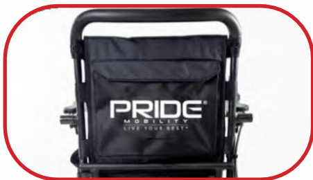
Convenient storage pouch