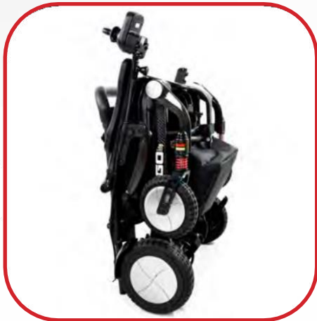
iGO Carbon Fibre (folded configuration)

OFFERING LIGHTWEIGHT CONVENIENCE - JUST FOLD AND GO!