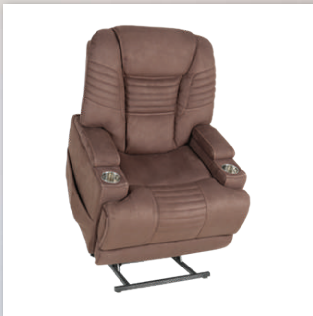
Shown in Mosaic (Fudge)