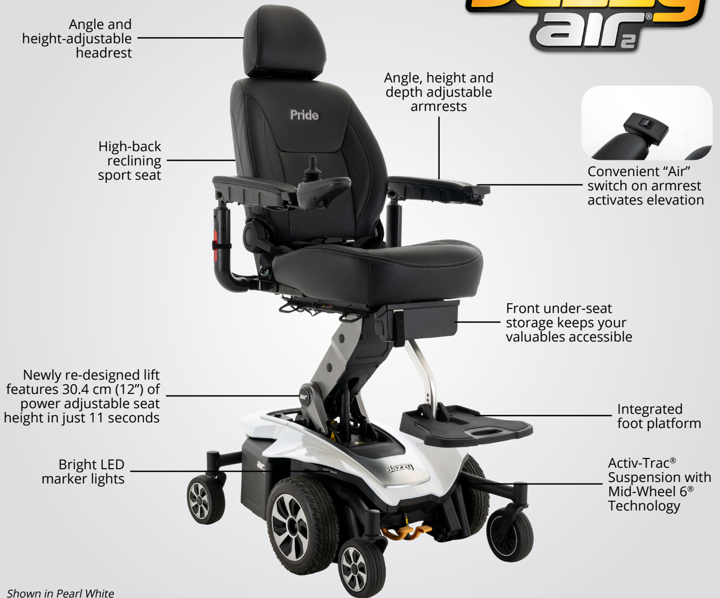
Shown in Pearl White