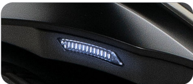
Bright LED marker lights

At the touch of a switch, the Jazzy Air 2 elevates 30.4 cm in just 11 seconds. With a sleek, more modern look, this power chair safely drives at speeds up to 6.4 km/h while elevated, allowing users to enjoy face-to-face social engagement. With Mid-Wheel 6 ® Drive and Active-Trac ® Suspension, the Jazzy Air 2 offers superb performance and stability both indoors and out.