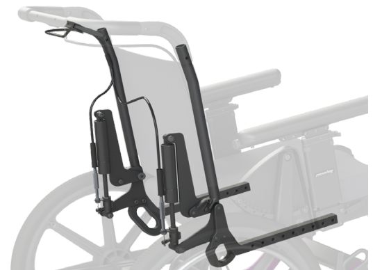
Reclining Backrest | up to 30° of recline